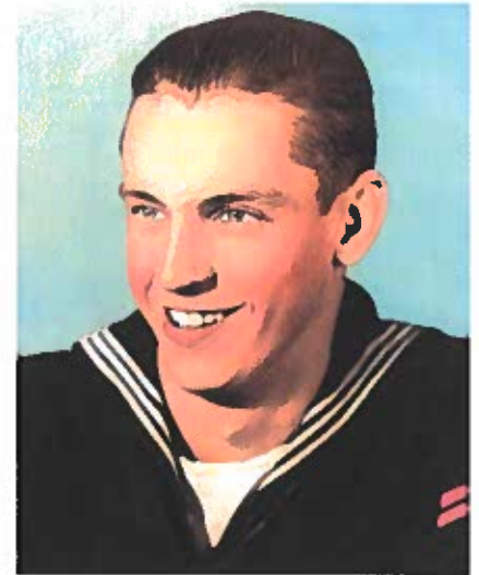
March 20, 1934 – January 30, 2015